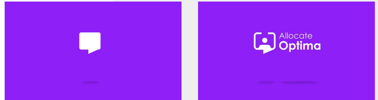
Storyboard of Animation